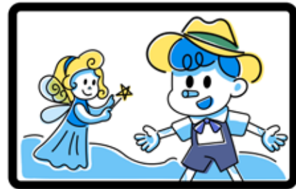
④ Enter the story and become the main character of the story.